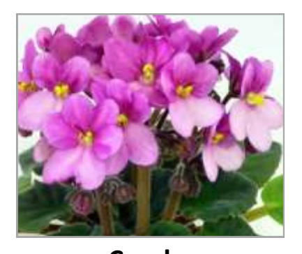
Creek Volume discounts available.