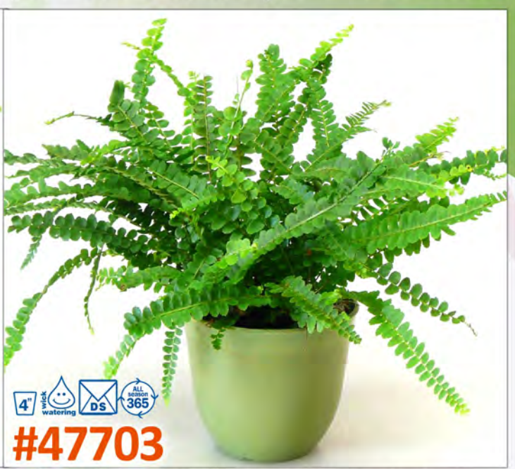
4" Fern in attractive Bio-pot & standard grow-pot.