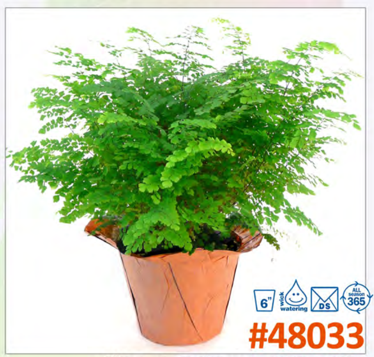
6" Fern in Foil Cover with Beautiful Seasonal Colors with grow-pot

Exciting New Ferns Evaluated Yearly! *Selections May Vary By Season