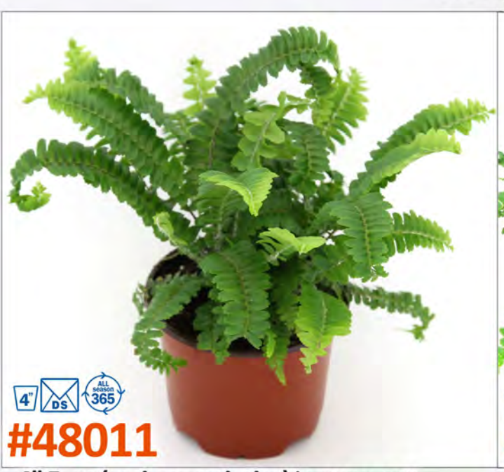
4" Fern (various varieties) in grow-pot.