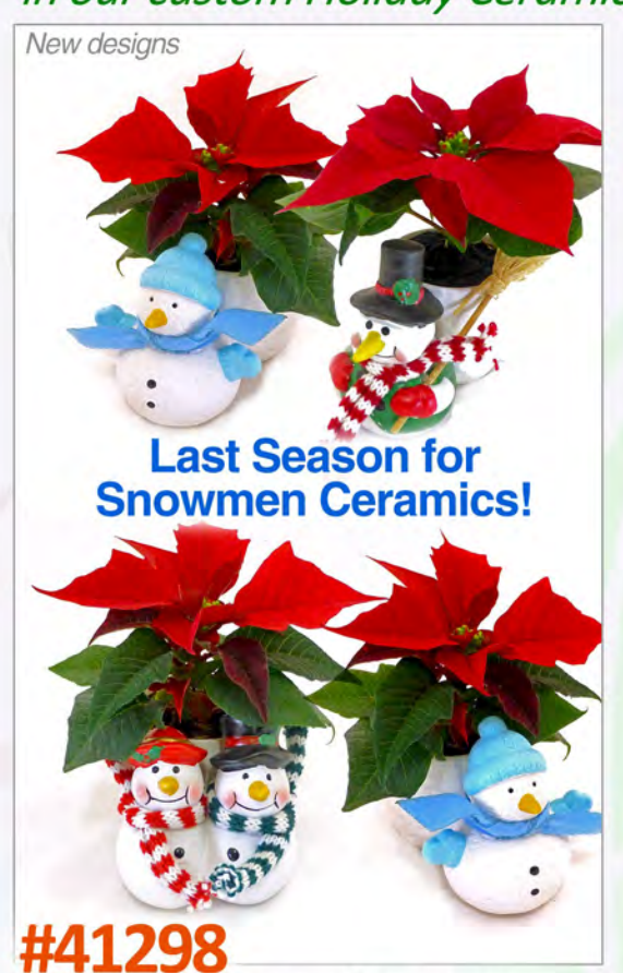
Snowmen Ceramics Set of Four with scarf & broom details + 2" Mini-Poinsettias